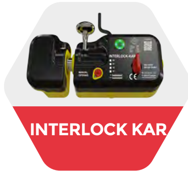
Robust, compact interlocking solution with SS handle