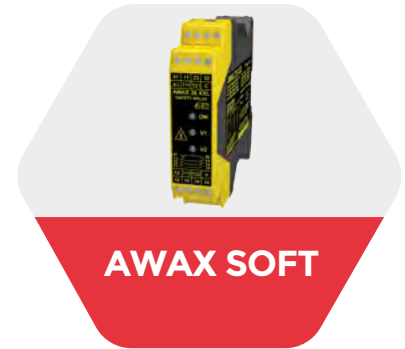
Mini PLC with eight clickable safety functions