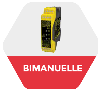
Safety relay rated PLe/SIL3 homologated for Two hands control solution