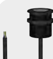
B22 B30 B50

Atex Certified range : III GD-EEEx ia IIC T4