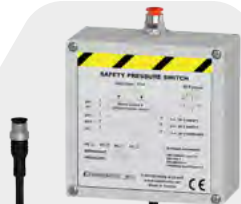
GAZ & FLUIDE AIR COMPRIME

Safety relays & safety control modules SIL3 PLe